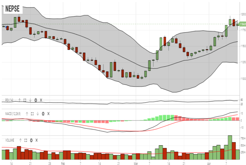
Indicators used: Bollinger Bands, MACD, RSI, Moving Average (20 days) Volume