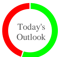
Indicators used: Bollinger Bands, MACD, RSI, Moving Average (20 days) Volume

Disclaimers: This MARKET SUMM is prepared to timely update the market participants about the Nepalese stock market before the Market opens for the day. The information and data herein should not be construed as an investment advice or recommendation. Should the investors choose to act based on this report, it shall be entirely at their own risk and KCL Astute shall not be liable, for any loss or damages incurred thereby. Unless otherwise specifically stated, the above data concerns the previous trading day.