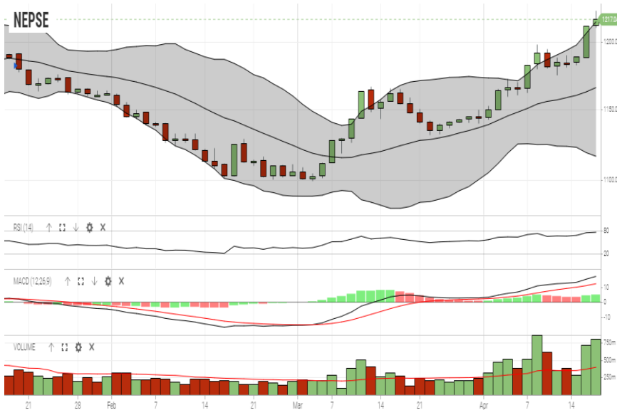
Indicators used: Bollinger Bands, MACD, RSI, Moving Average (20 days) Volume