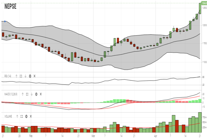
Indicators used: Bollinger Bands, MACD, RSI, Moving Average (20 days) Volume