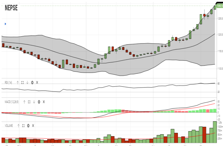
Indicators used: Bollinger Bands, MACD, RSI, Moving Average (20 days) Volume