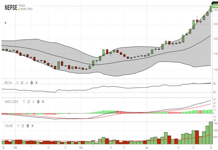
Indicators used: Bollinger Bands, MACD, RSI, Moving Average (20 days) Volume